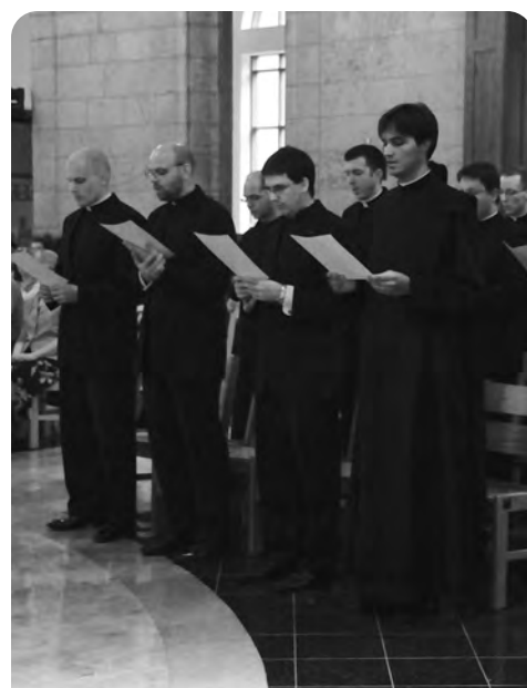
Seminarians make their priesthood promises in the St. Thomas Aquinas Chapel on April 23.