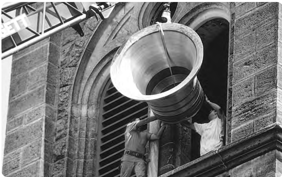
Bell number six cracked and was replaced in 1997 during the Archabbey Church renovation.