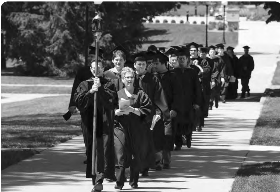
The 2009 graduates process down the main walkway before the graduation ceremony on May 9.