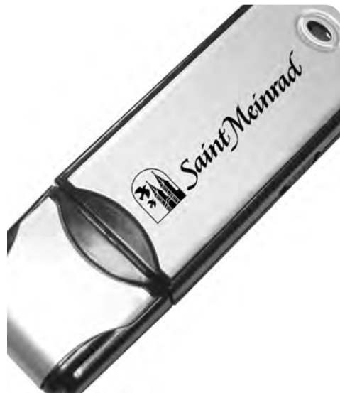
The flash drive includes two slideshows of Saint Meinrad photos.

"Alumni should enjoy these collections of images set to music," says Schaefer. "There's a good mix of current images and historical photos from around the Hill and the School." +