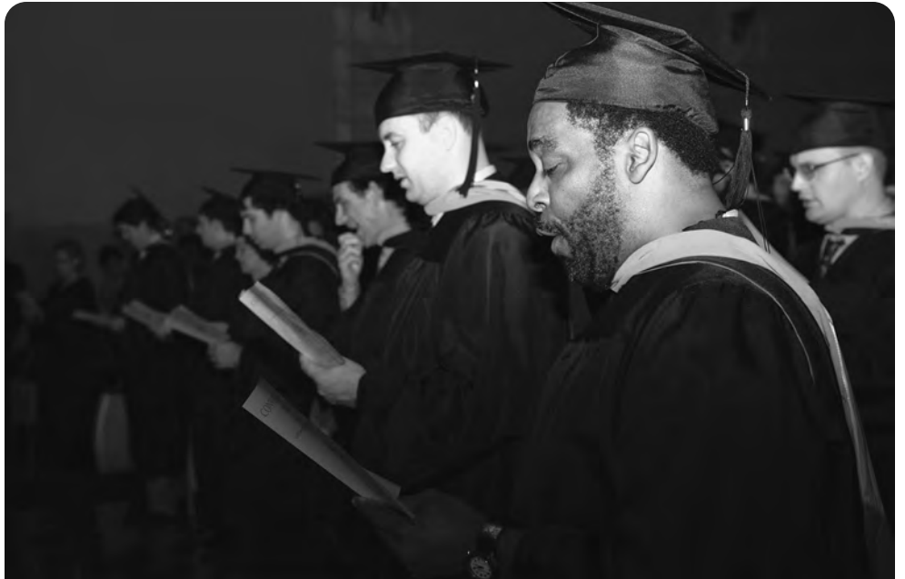
Graduates sing the opening hymn at the graduation convocation.