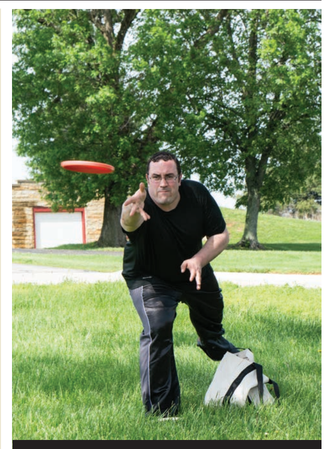
You can find more photos of Saint Meinrad events at http://saint-meinrad.smugmug.com

The Editor, The Development Office, Saint Meinrad Archabbey and Seminary & School of Theology, 200 Hill Drive, St. Meinrad, IN 47577, (812) 357-6501 • Fax (812) 357-6759, news@saintmeinrad.edu www.saintmeinrad.edu, © 2017, Saint Meinrad Archabbey