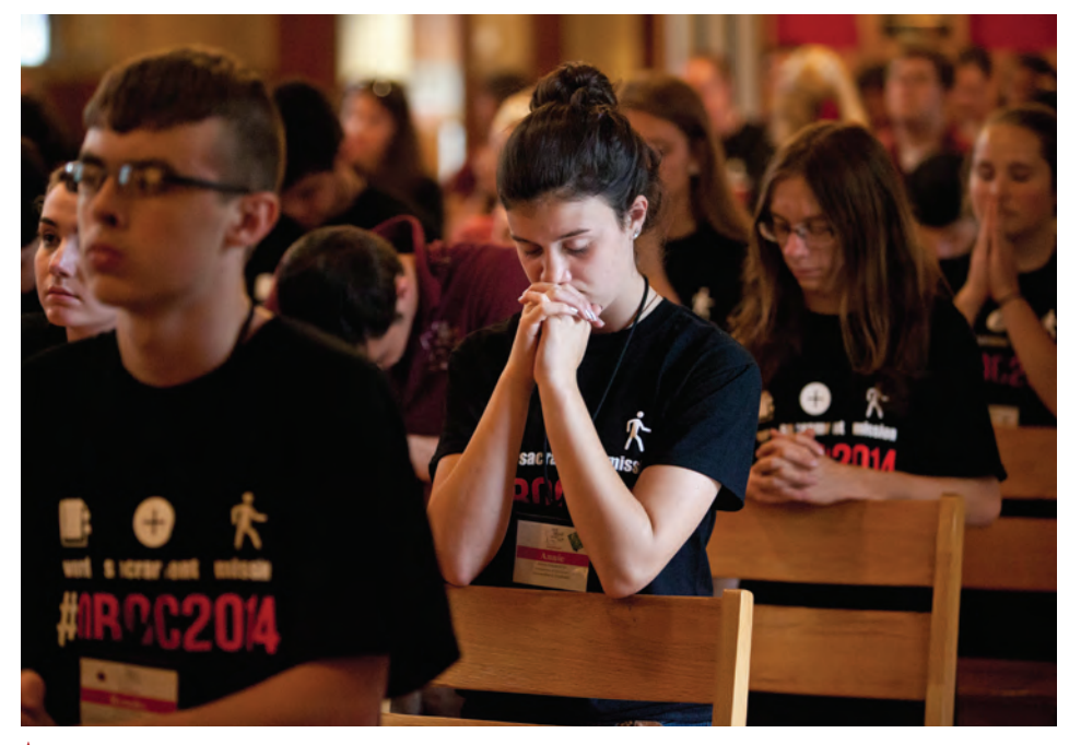
▲ High school youth pray at the opening Mass of the "One Bread, One Cup" program this summer.

Who will be the next generation of Church leaders? Who will share their time, talent and treasure to build strong, faith-filled communities?