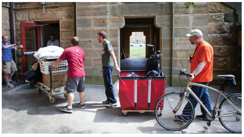
Seminary students move in on August 22.

The decrease in seminarians this year can be partly attributed to a large number of students graduating and being ordained the last two years.