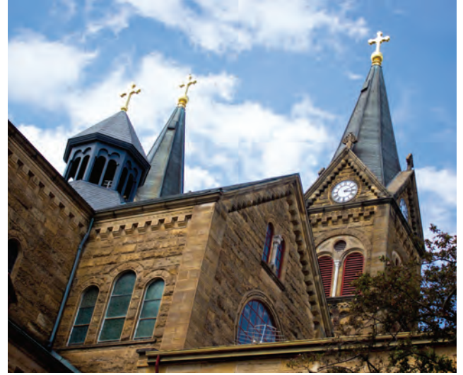
Archabbey Church's towers point toward a summer sky.