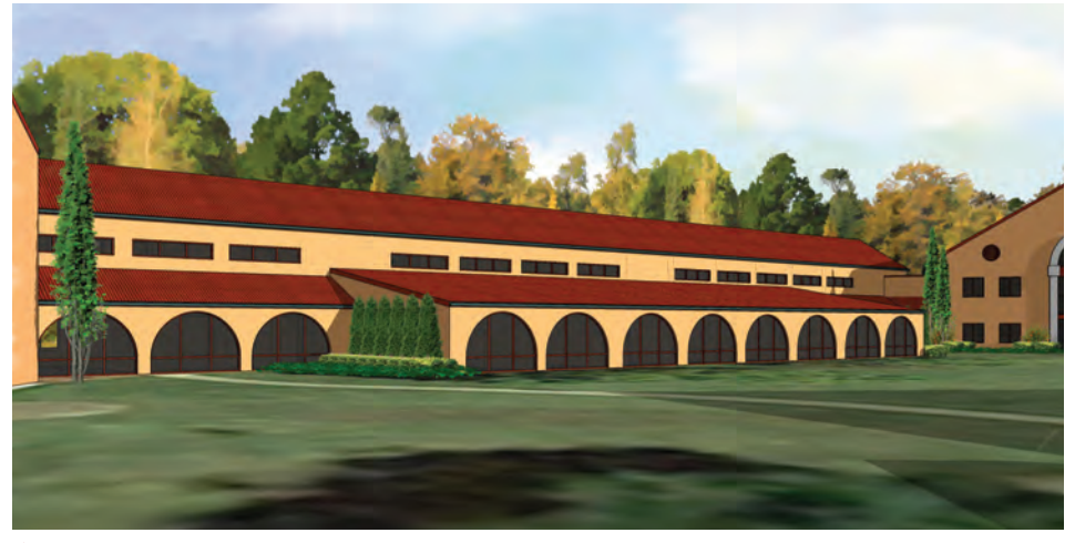
An artist's rendering shows the expanded infirmary wing that will look onto the monastery courtyard.

Chapter 36:1 of the Rule of St. Benedict states: "Care of the sick must rank above and before all else, so that they may truly be served as Christ."