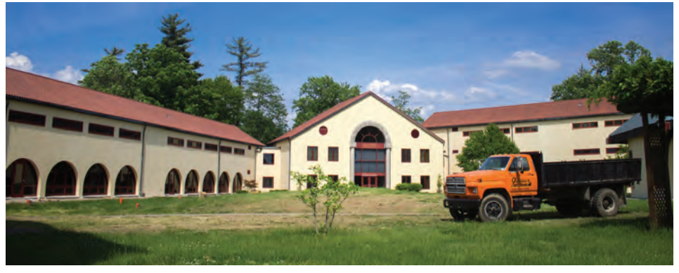
Work began on the monastery projects in May and is expected to conclude by August 2016.

The monastery repairs are estimated to cost $8.5 million, and the infirmary renovation will cost an estimated $1.6 million. The work is expected to be complete by August 2016. 4