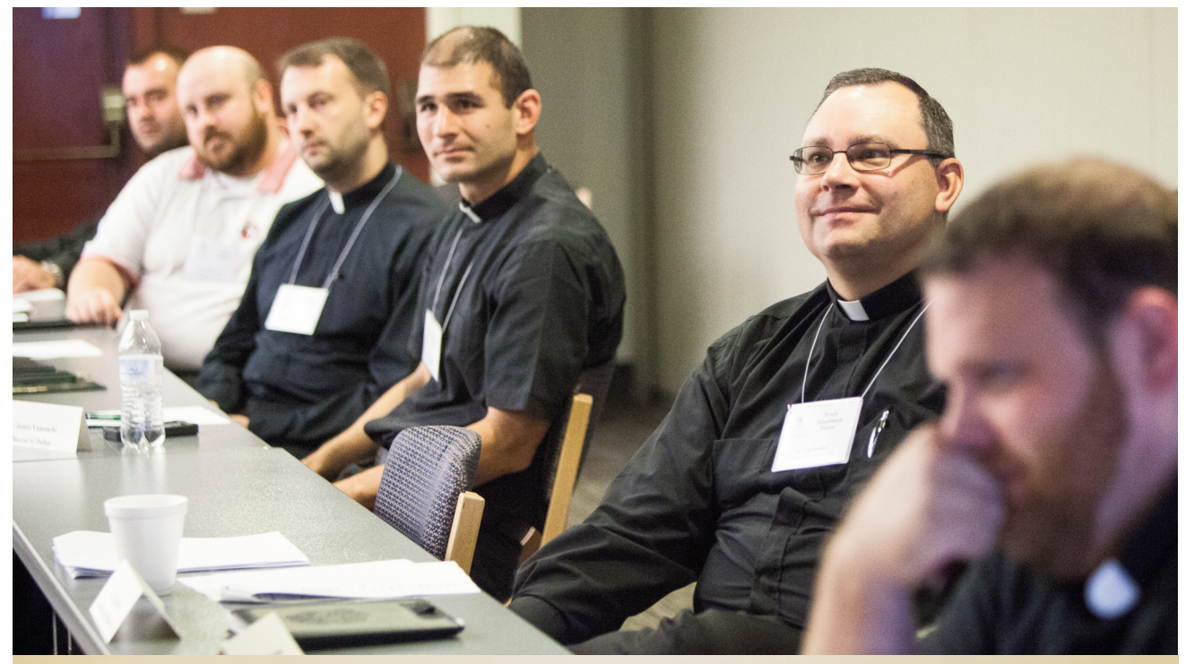
"Every priest is a disciple on a journey, constantly needing an integrated formation, understood as a continuous configuration to Christ."