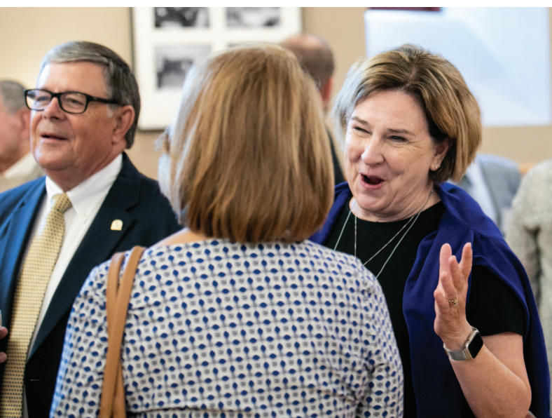
▲ The "Forward Together: For the Life of the Church" campaign kickoff event was held at Saint Meinrad Archabbey on August 22, 2021. The evening included Vespers with the monastic community, followed by a reception, dinner and a program in St. Bede Hall.