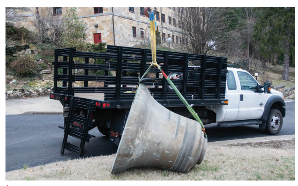
Bell #6 weighs 2½ tons and measures 52 inches high. It was installed in the Archabbey Church on July 2, 1997.

Those who wish to make a gift toward the bell and clock repairs can do so at: donate.saintmeinrad.edu.