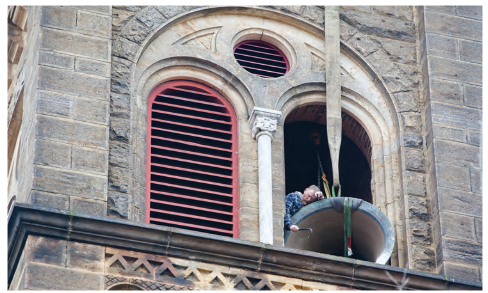
▲ A worker chips away sandstone to allow Bell #6 to be removed for repair.