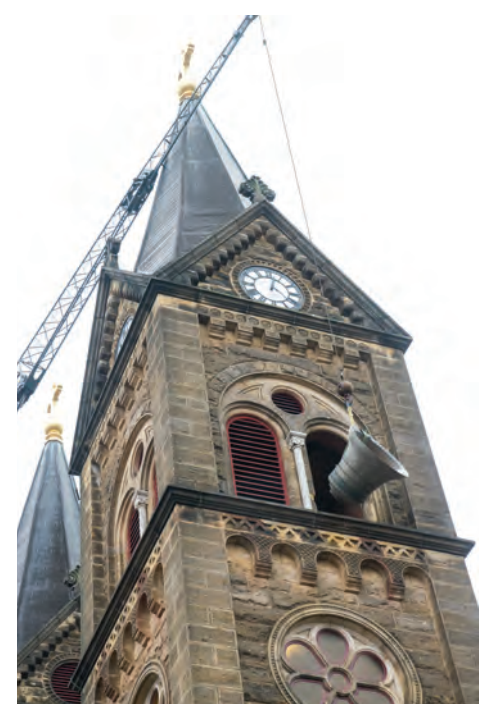
A crane lifts Bell #6 from the church tower on February 8.

A little joke in the monastery is that the bells are the voice of God calling the community to prayer. That voice has temporarily been silenced.